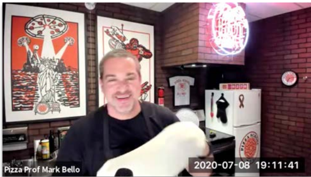
It’s all smiles! We’ve created the same caliber 5-star experience virtually that our customers have consistently praised in online reviews, as we “reach through the screen” and deliver a truly shared experience for colleagues/clients/friends and family.