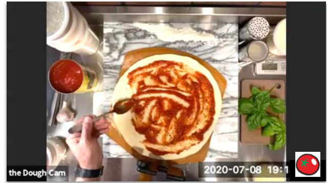
the Dough Cam: Pizza School’s exclusive technology giving all participants a bird’s-eye view of the pizza-making action so they can master it along with our expert/easy-to-follow instructions.