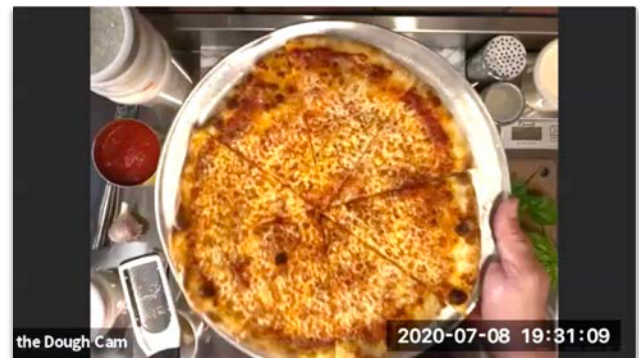
The Proof is in the Pizza describes the moment when everybody gets to marvel at the incredible pizza they just made in their home kitchen! “Best ZOOM event ever - everybody LOVED it!” is the feedback we’ve been getting every time!