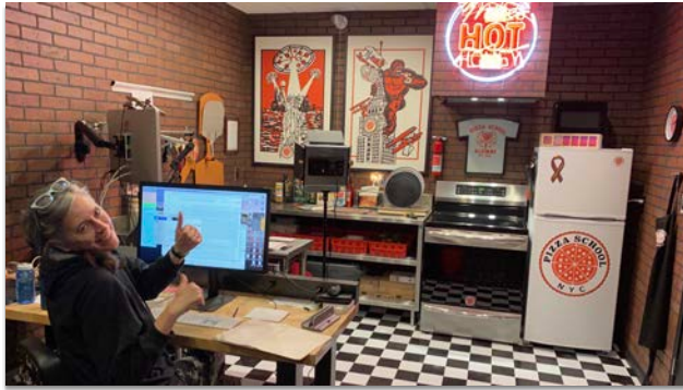
JUNE 2020 Pizza School NYC completes its state of the art “Virtual Events Cooking Studio” for hosting 5-star interactive pizza-making events and culinary experiences.