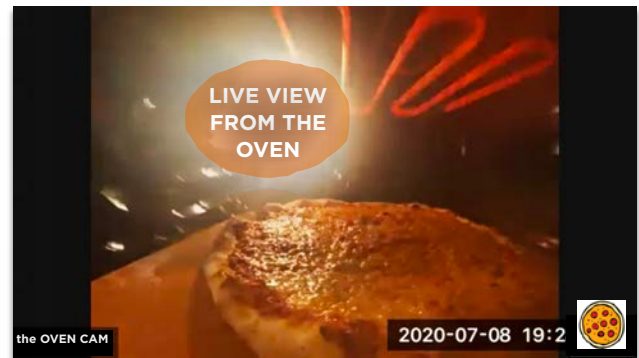
the Oven Cam: Pizza School’s exclusive technology where all viewers get to travel with the pizza in and out of the oven as it bakes! Serious WOW factor here – Shhh! Save the surprise :)