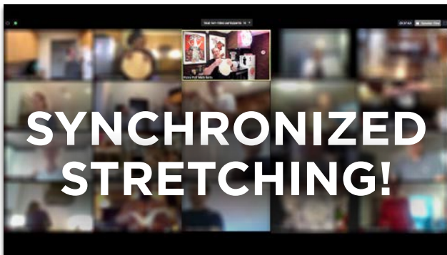
“Synchronized Stretching” is the magical moment when all pizza-making participants on screen see each other simultaneously stretching pizza dough like pros!